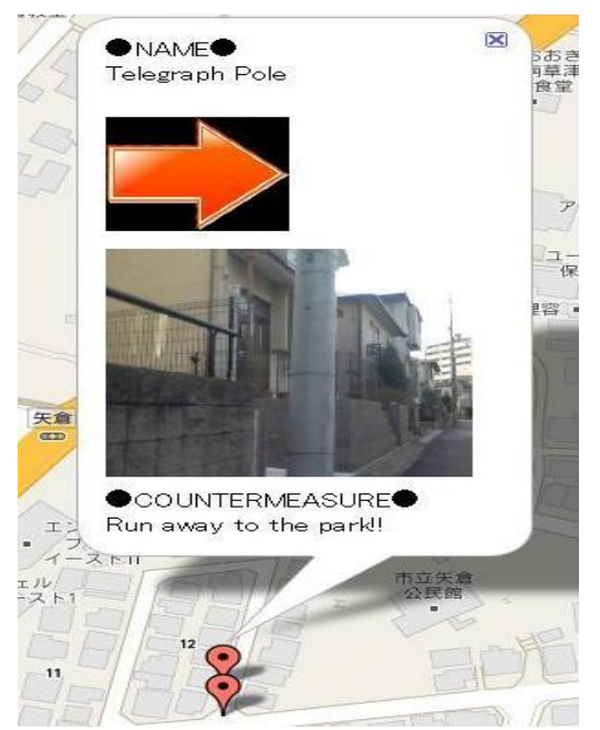
Fig. 7. Example of the system being used by parents

Proceedings of the World Congress on Engineering and Computer Science 2011 Vol I WCECS 2011, October 19-21, 2011, San Francisco, USA