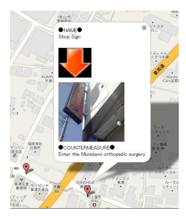
Fig. 6. Example of the system being used by parents

One parent did not spend much time on identifying any dangerous objects and instead emphasized comments on the direction of evacuation when she input dangerous objects into the system. Schools typically decide school routes beforehand and oblige students to go to school in groups, revealing the care taken with the safety of the children. It follows from this that school routes typically have few dangerous objects along them.