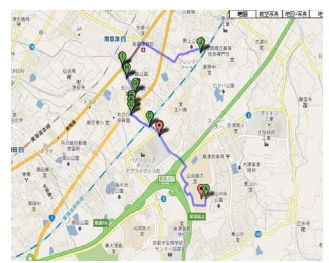
Fig. 3. Sample safe evacuation route

Routes judged safe from home to school by parents can also be specified and displayed on the map using different colors, which children can use to judge how to deal with any immediate dangers, confirm a safe route, and identify their present location. Figure 3 depicts a typical map.