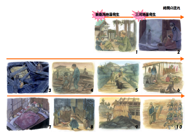
Fig. 1. Paintings as disaster education materials

They experimented on the children using the below 10 situations in the same order.