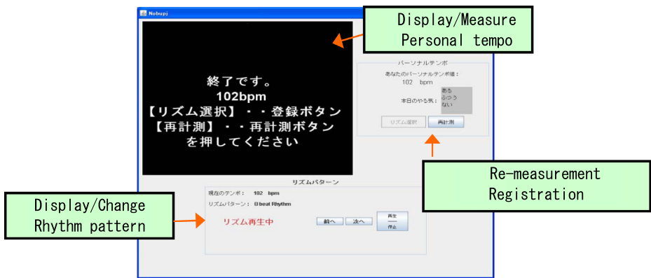
Fig. 2. A Screen Image of System

This system measures user's personal tempo immediately before working, because the personal tempo is not always constant. It shows in Figure 2 as an example of the system screen.